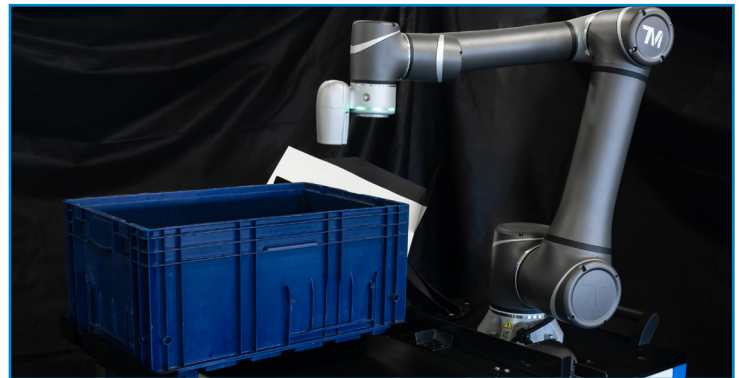
Holders for packaging boxes