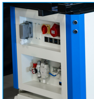
Electro and pneumatic interfaces